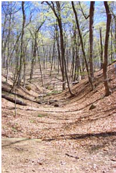
Spring comes to Matthiessen State Park

We are still collecting ink jet cartridges and cell phones. This has been so easy we will be continuing the collection. So keep collecting and bring them to the meetings. This is an easy way to recycle (Focus on Women) and make money. So keep up the collection and we will still keep making money.